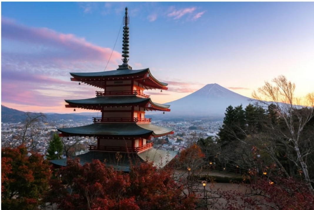
Arakura Fuji Sengen Shrine, Mt. Fuji, and the town of Shimoyoshida at sunset.

Enjoy a traditional seafood lunch in the historic town of Shimoyoshida before returning to your lakeside resort for a well-deserved rest. The afternoon is yours to explore or simply relax while gazing at Mt. Fuji's majestic silhouette.